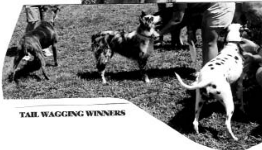
TAIL WAGGING WINNERS