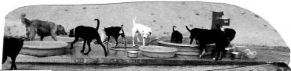
R-Dog has added a cement pad for the pools and two new benches for canines and humans to enjoy.