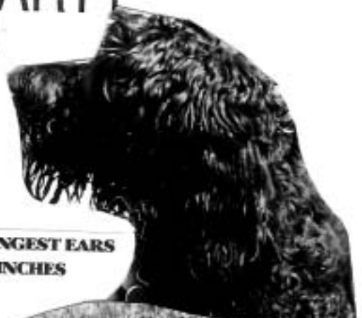
LONGEST EARS 9 INCHES