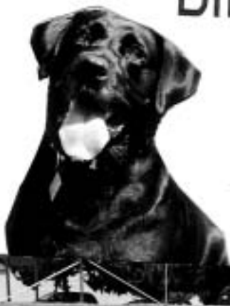
STAY & SIT WINNER